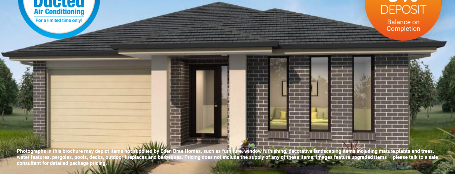
Photographs in this brochure depict items not supplied by Eden Brae Homes, such as furniture, window furnishing, decorative landscaping items including mature plants and trees, water features, pergolas, pools, decks, outdoor fireplaces and barbecues. Pricing does not include the supply of any of these items. Images feature upgraded items – please talk to a sales consultant for detailed package pricing.